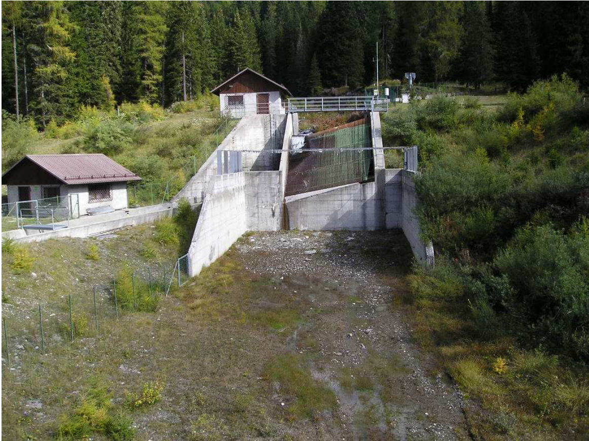
Figure 4: ARPAV's solid discharge measuring station (upstream part)