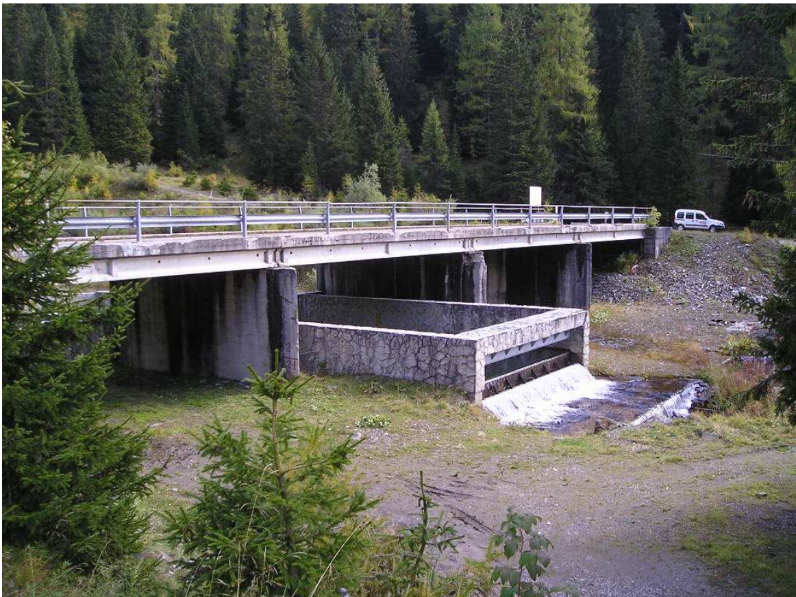
Figure 5: ARPAV's solid discharge measuring station (downstream part)