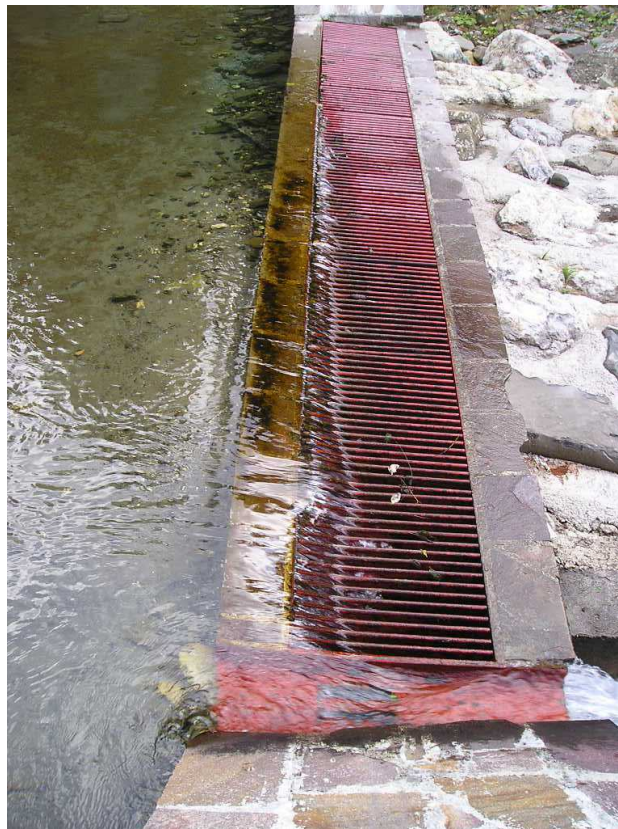
Figure 3: BIM HP plant intake: detail of the grid on the top of the check dam.