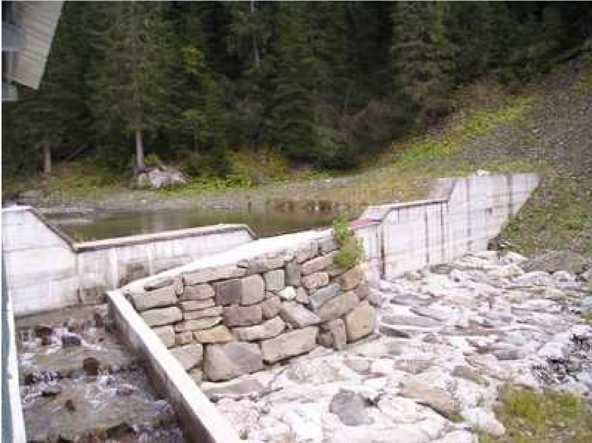
Figure 2: BIM HP plant intake. The water abstraction work is made of a grid placed on the top of the check dam.